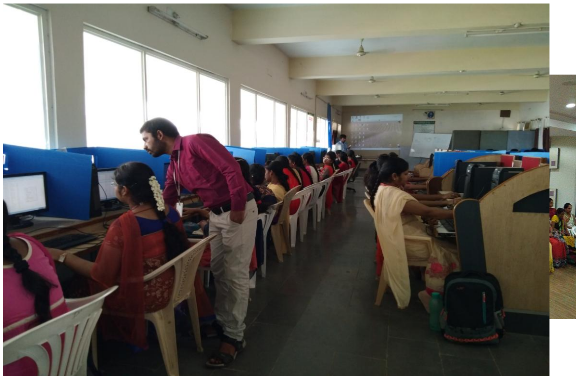
Students were participated in hands on experience in Embedded systems certificate course.

Fourth day: Last day students enjoyed with hands-on session by doing simple projects & also clarified their doubts with resource persons on various topics.