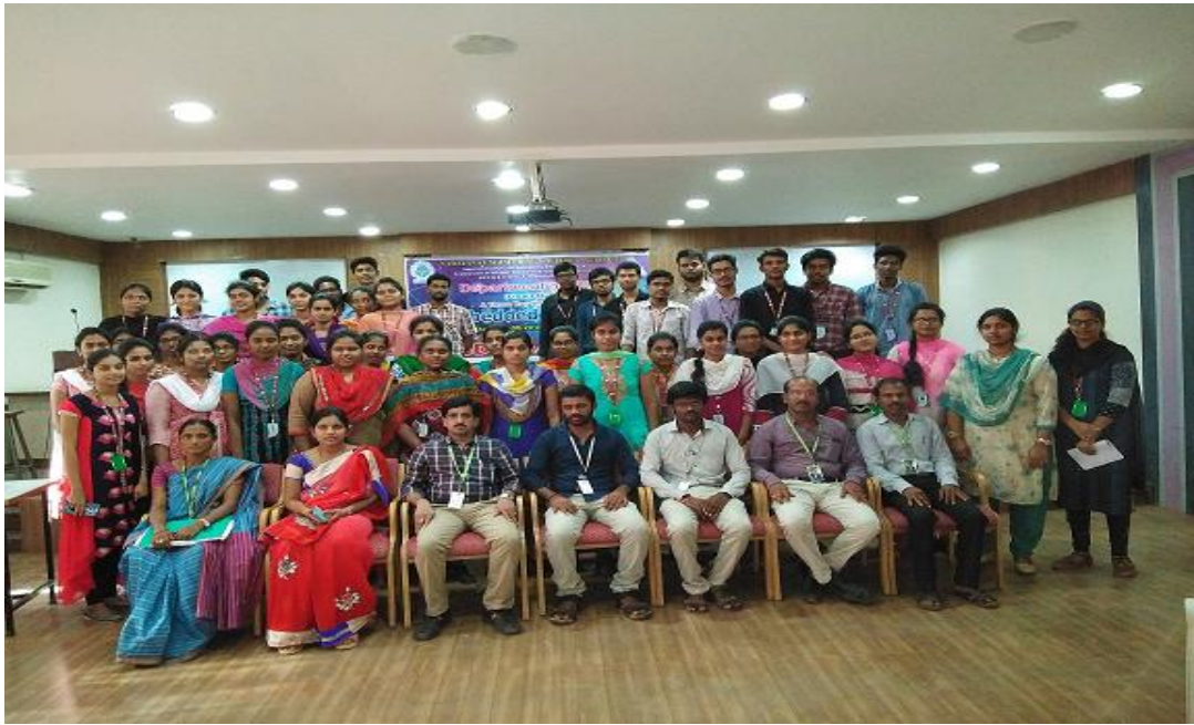
Resource persons, College staff, students from III year ECE was participated in valedictory session of a four day certificate course.

Assessments/Practice test: To ensure that students have understood the content covered during the session; a brief test will be conducted on LMS after every training session. This will help the student understand where he/she needs to improve. LMS (Learning and Management System) is built from Open-Edx. It contains all course related content such as hand-outs, videos and practice sessions. APSSDC will provide individual student account and Student/college wise analytics are also available.